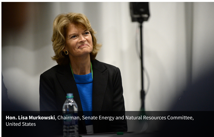
Hon. Lisa Murkowski , Chairman, Senate Energy and Natural Resources Committee, United States