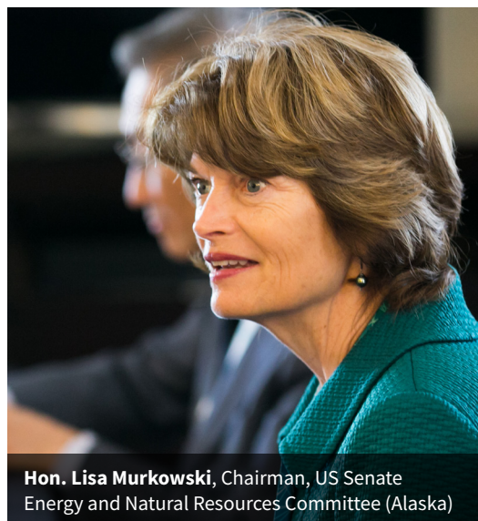
Hon. Lisa Murkowski , Chairman, US Senate Energy and Natural Resources Committee (Alaska)