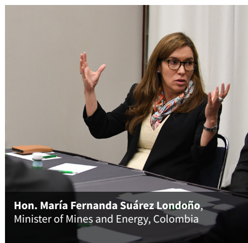
Hon. María Fernanda Suárez Londoño , Minister of Mines and Energy, Colombia