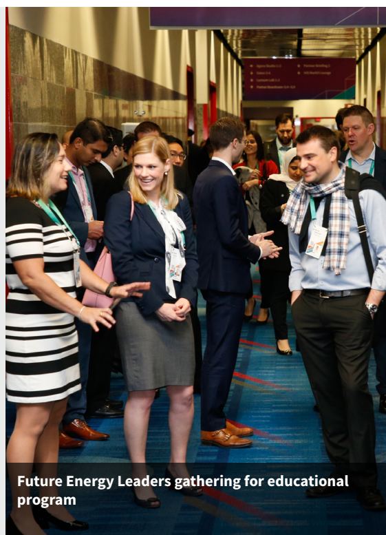
Future Energy Leaders gathering for educational program

Future Energy Leaders – offers high-potential industry executives the opportunity to participate in CERAWeek, in addition to attending special educational programs and receptions designed to foster a community of future leaders and promote building new relationships. The Professional Development Program augments the Future Energy Leaders with two days of immersive career development.