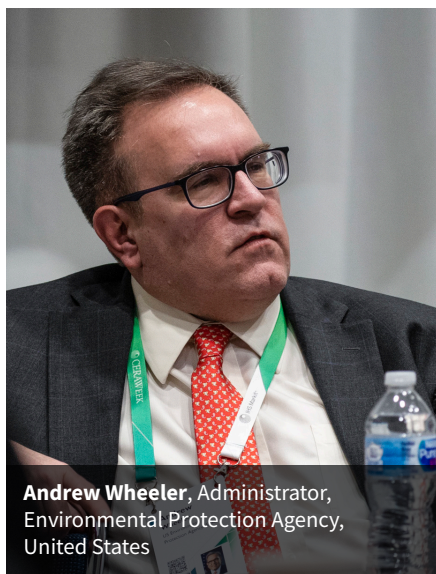
Andrew Wheeler , Administrator, Environmental Protection Agency, United States