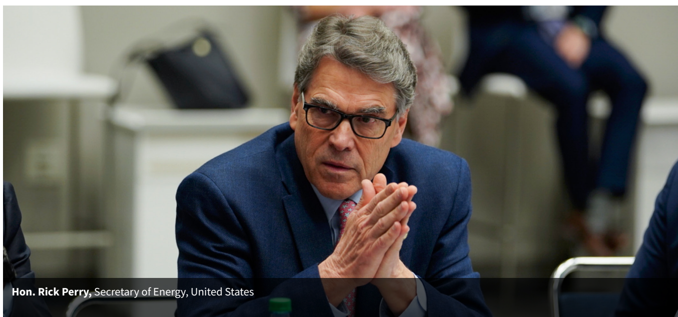
Hon. Rick Perry , Secretary of Energy, United States