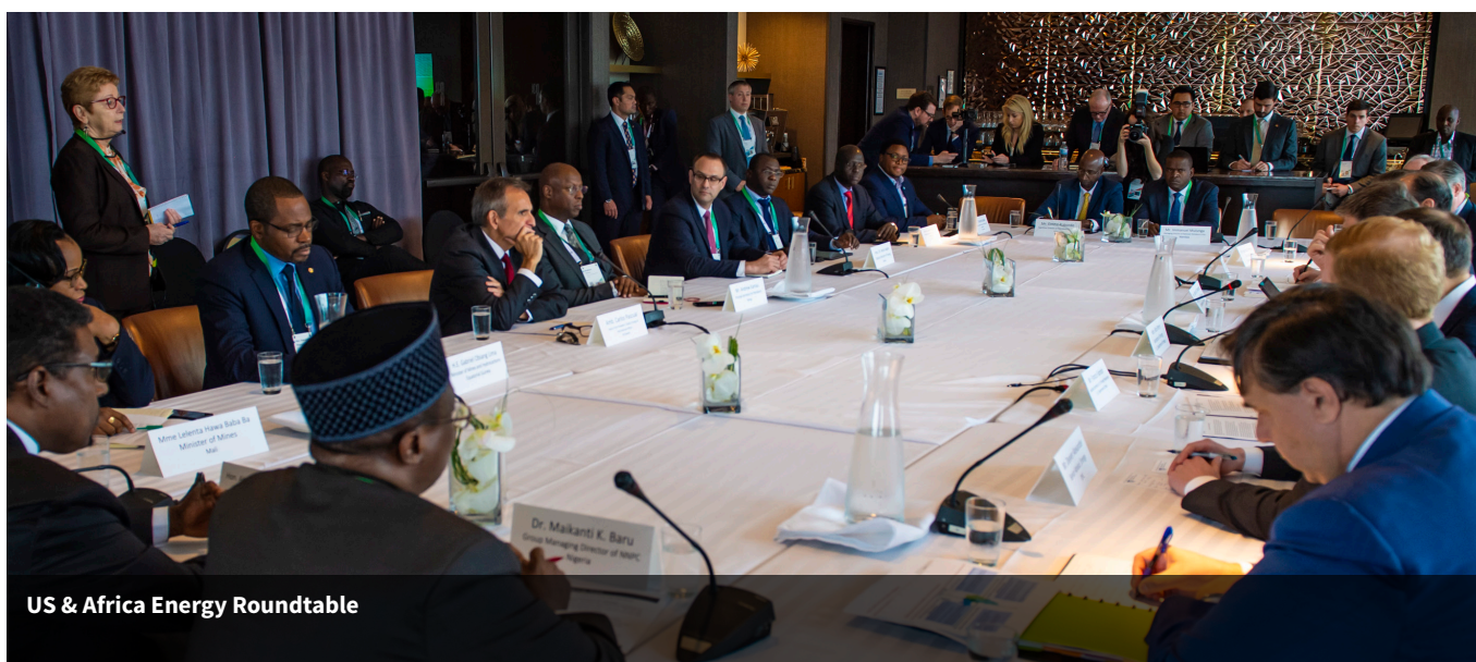
US & Africa Energy Roundtable