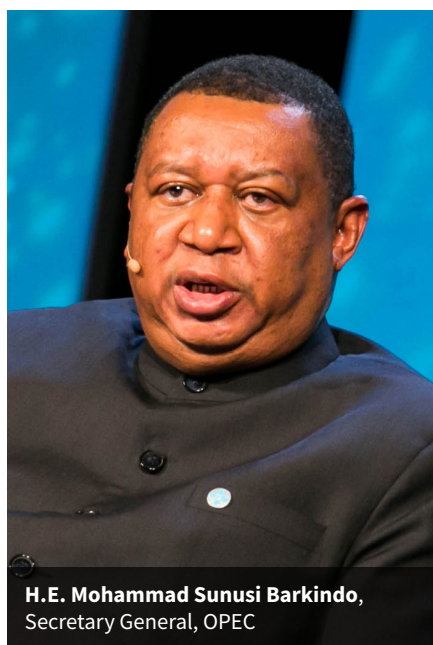
H.E. Mohammad Sunusi Barkindo , Secretary General, OPEC