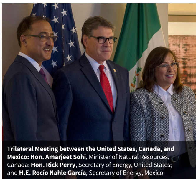
Trilateral Meeting between the United States, Canada, and Mexico: Hon. Amarjeet Sohi, Minister of Natural Resources, Canada; Hon. Rick Perry, Secretary of Energy, United States; and H.E. Rocío Nahle García, Secretary of Energy, Mexico