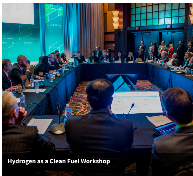
Hydrogen as a Clean Fuel Workshop