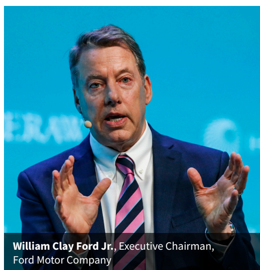
William Clay Ford Jr. , Executive Chairman, Ford Motor Company