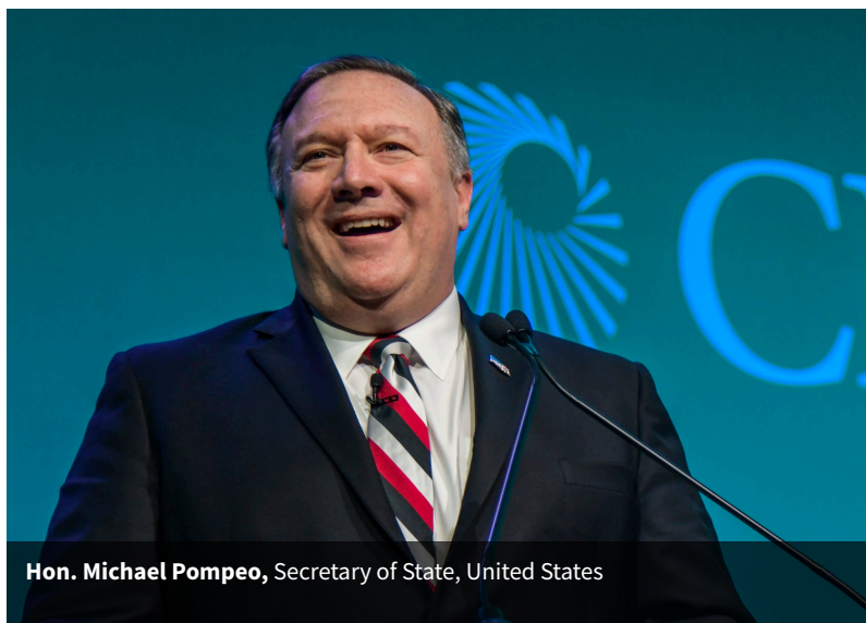
Hon. Michael Pompeo , Secretary of State, United States