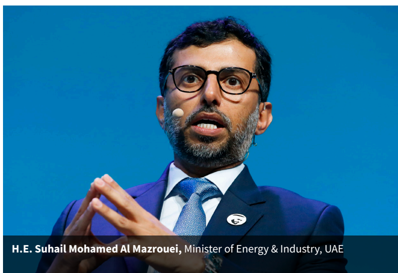
H.E. Suhail Mohamed Al Mazrouei , Minister of Energy & Industry, UAE