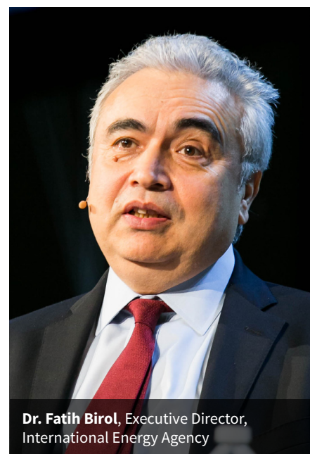
Dr. Fatih Birol , Executive Director, International Energy Agency