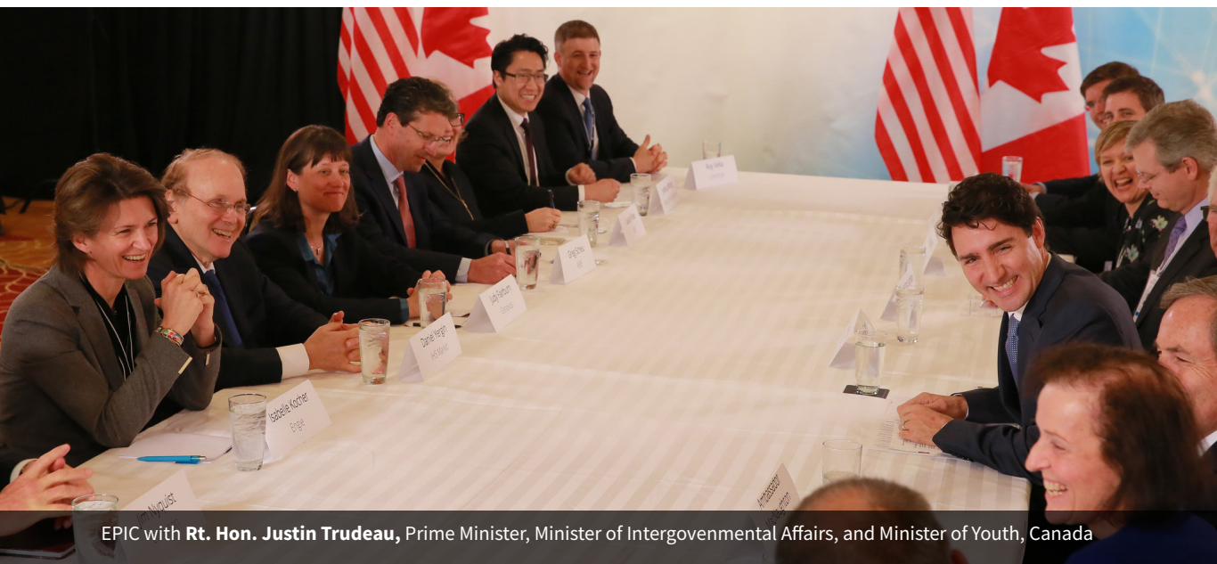
EPIC with Rt. Hon. Justin Trudeau, Prime Minister, Minister of Intergovernmental Affairs, and Minister of Youth, Canada

CERAWeek convenes small private roundtable meetings with ministers and senior public officials for informal discussion. Organized subject to the availability of officials, EPICs offer a unique opportunity for relaxed dialogue and interaction. Qualified Partners receive priority consideration to attend EPICs.