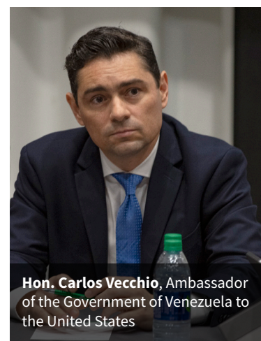
Hon. Carlos Vecchio , Ambassador of the Government of Venezuela to the United States