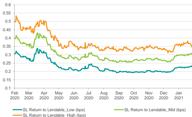
SL Returns to Lendable : Feb 20 to Jan 21