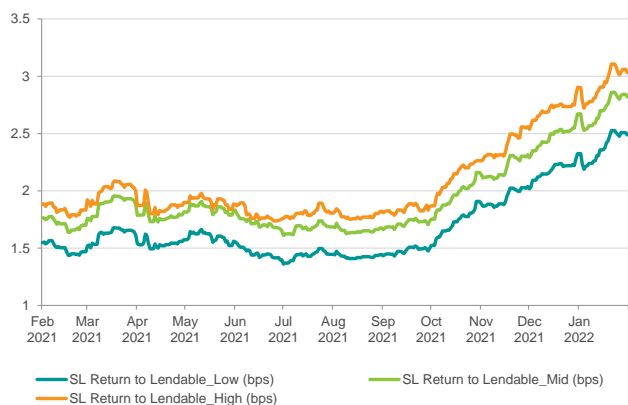
SL Returns to Lendable : Feb 21 to Jan 22