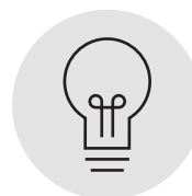
Deal time insights