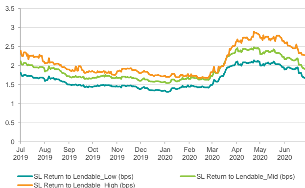
SL Returns to Lendable : Jul 19 to Jun 20