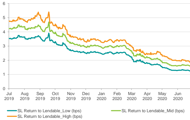
SL Returns to Lendable : Jul 19 to Jun 20