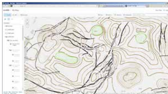
Permian Basin Structure Contours viewed in ArcGIS Online

International Culture – This geographic content serves as a foundational background for high-quality maps. New and updated features are regularly added to provide the most current, accurate coverage. Content includes a worldwide set of bathymetry, political, administrative and licensing grid layers which are integrated with our E&P information allowing for spatial analysis and validation.