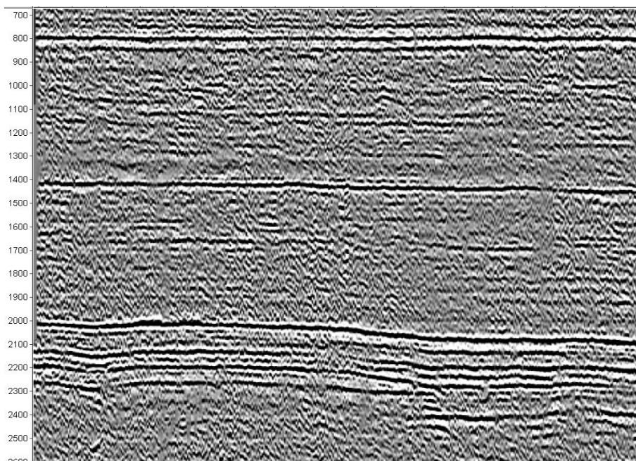
Example of 1984 seismic section

For further details contact Adrian.Heafford@ihs.com