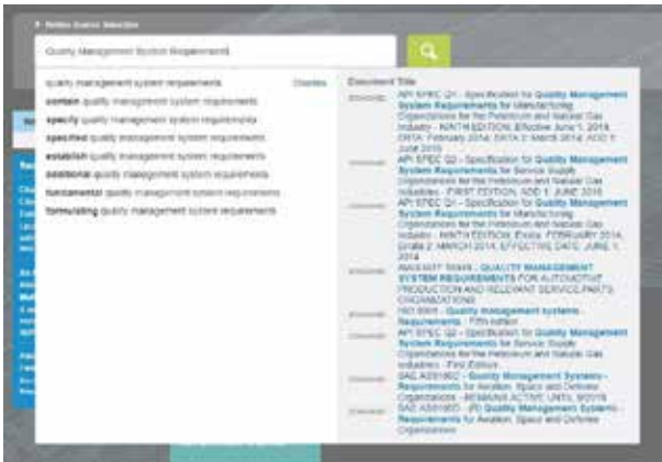
The "Intelligent Search Box" is smart enough to distinguish a document number and keywords search.

As described above, the ability to "pin" bookmarks, projects, saved searches and other information to the user's home screen makes it easy to access documents quickly and easily. Engineering Workbench also provides the My Workspaces tool for managing a user's portfolio of saved content, so engineers are always in control of their personal information space within the platform.